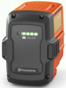
BLi30 7 amp hours