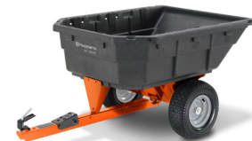
12.5 CU. FT. POLY SWIVEL DUMP CART