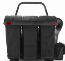
ZERO-TURN TRIPLE BAGGERS