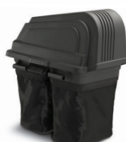
TRACTOR TWIN BAGGERS