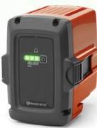
BLi22 4 amp hours